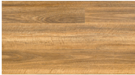
Spotted Gum ES104