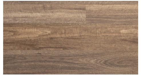
Reclaimed Flooded Gum ES107