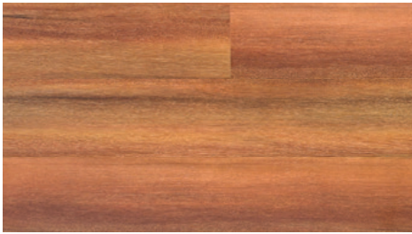
Red Gum ES102