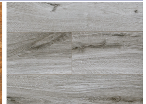
Grey Ash ES206

Warranties and Conditions information is available from your retailer, by download from www.imaginefloors.com.au , or by calling (03) 9794 3888. Sample colour image/piece to be used as a guide only and colour variation will vary from board to board. Colour appearance can also vary depending upon type of light under which a sample is viewed and the light source where the flooring is installed.