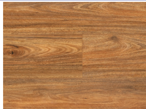
Spotted Gum ES202