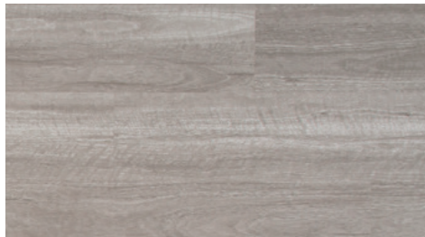
Snow Gum ES109