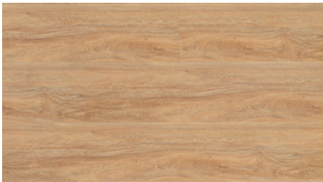
Tasmanian Oak ES108